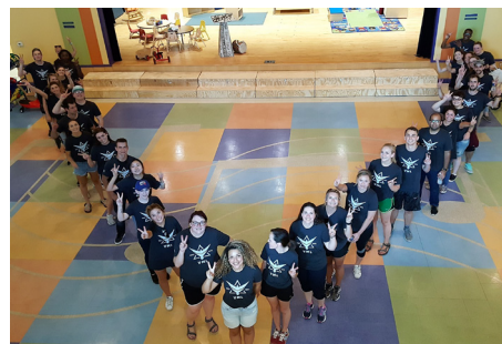
V is for Valued: St. Mark Center appreciates the time, effort, and enthusiasm of VML Interns who spent a day cleaning, organizing, and beautifying our campus.