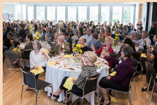
Nearly 200 guests raised a sparkling cider toast in celebration of UICS at the September 6 luncheon.