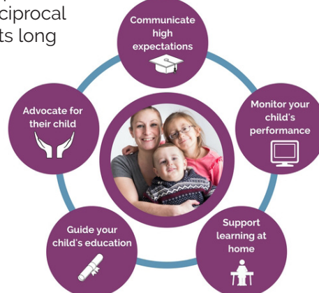
5 Roles of Families to Support Student Success